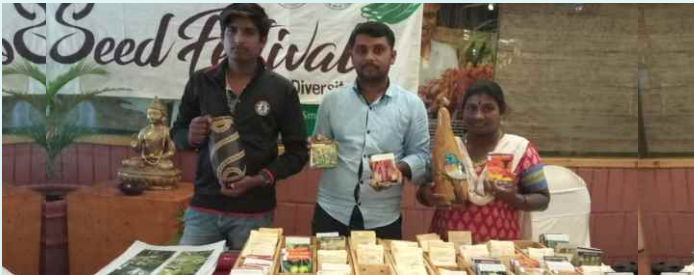
Desi Seeds Producer Company Limited