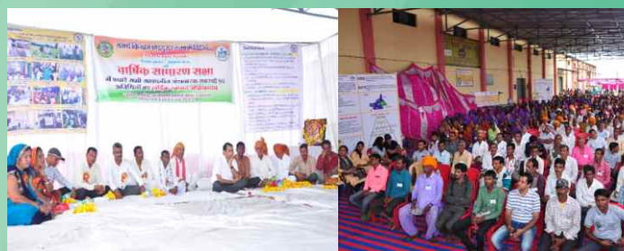
Samarth Kisan Producer Company Ltd.