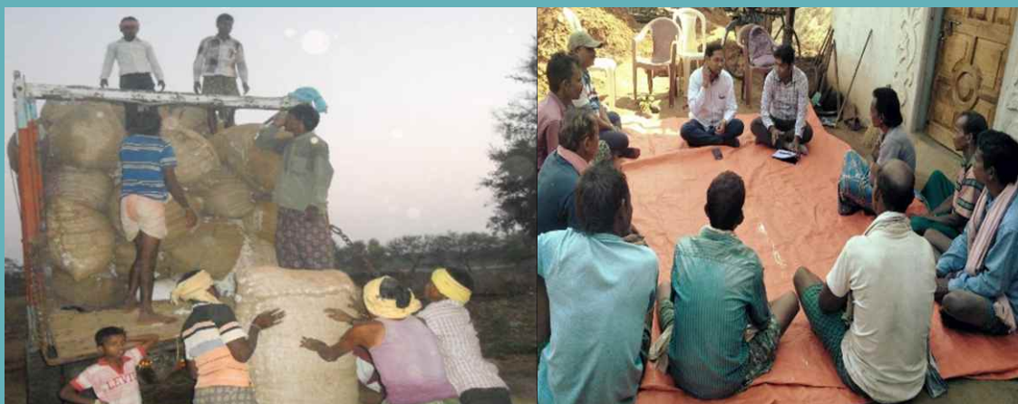
Prabeer Organic Agriculture Producer Company Limited