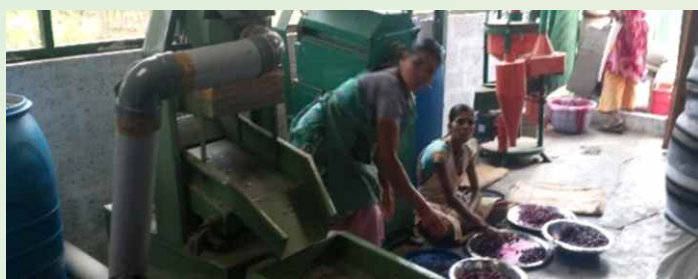
Aadhimalai Pazhangudiyinar Producer Company Ltd.