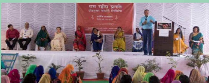
RamRahim Pragati Producer Company Ltd