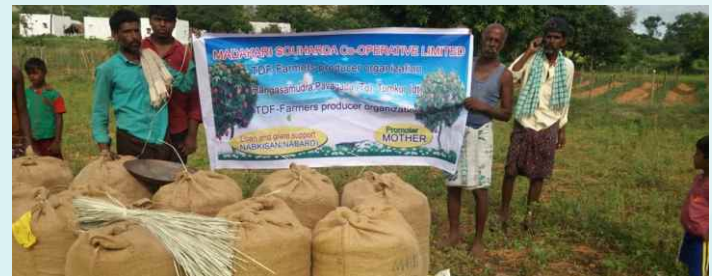
Madakari Sauharda Sahakari Niyamita, Pavagada, Tumkur