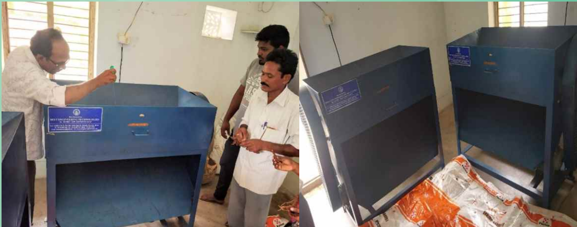
Vinoo Producer Company Limited