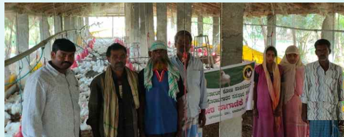
Madhya Karnataka Koli Sakanikedarara haagu Maratagaraa Sahakara Sangha Niyamitha