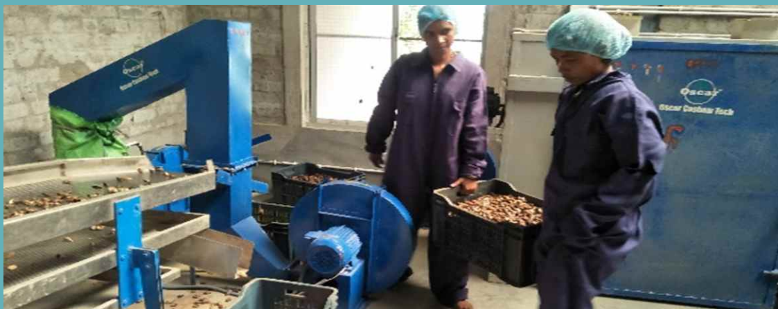
Srijoni Green Producer Company Limited