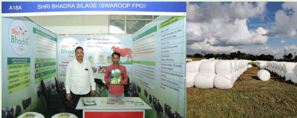
Swaroop Shetkari Producer Company Limited