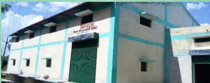
Bijawar Producer Company Limited