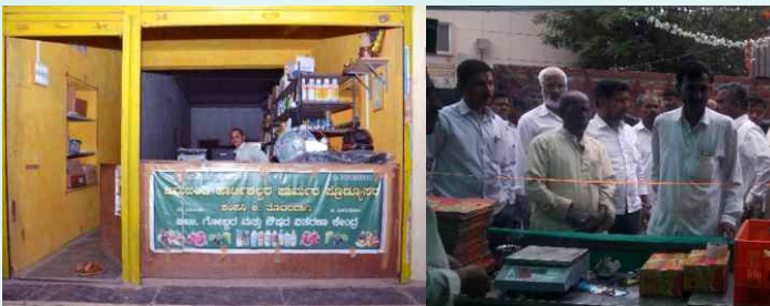
Jamkhandi Horticulture Farmers Producer Company Ltd, Karnataka