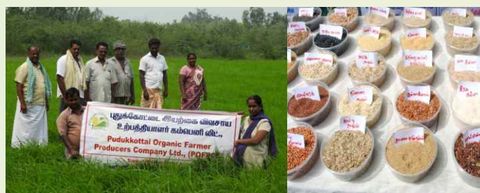
Pudukkottai Organic Farmers Producer Company Limited (POFPCL)