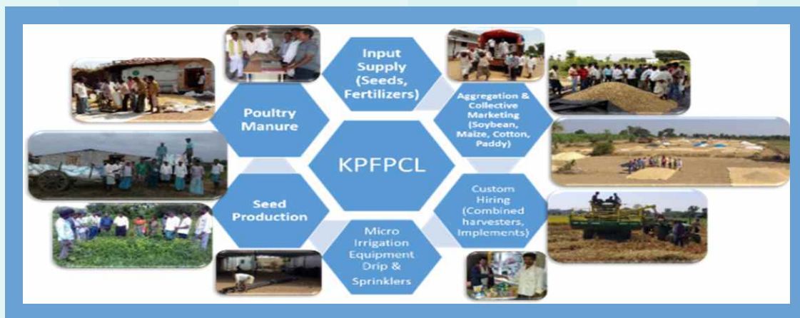
Kamareddy Progressive Farmers Producer Company Limited