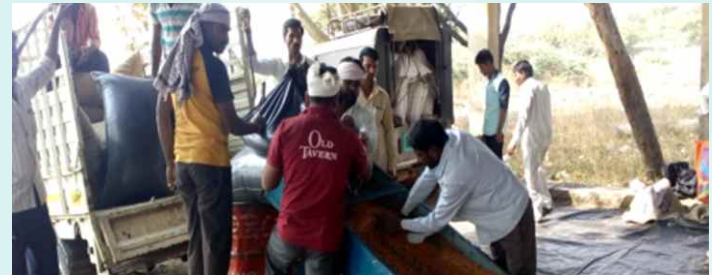
Sri Kshemalingeshwara Agro Producers Company Limited, Kalaburagi