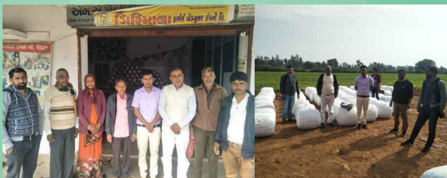
Girimala Farmers Producer Company Ltd.