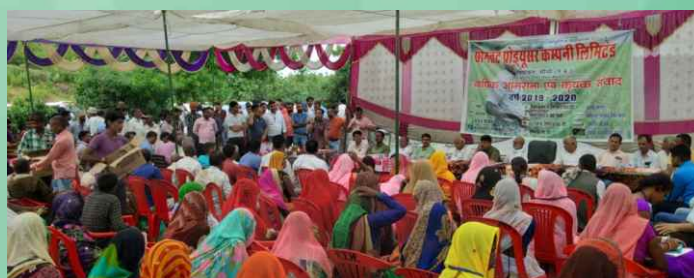
Sontat Producer Company Limited