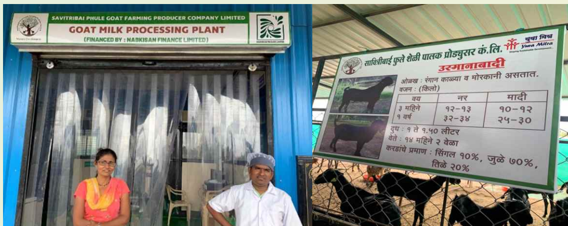
Savitribai Phule Goat Farming Producer Company Limited