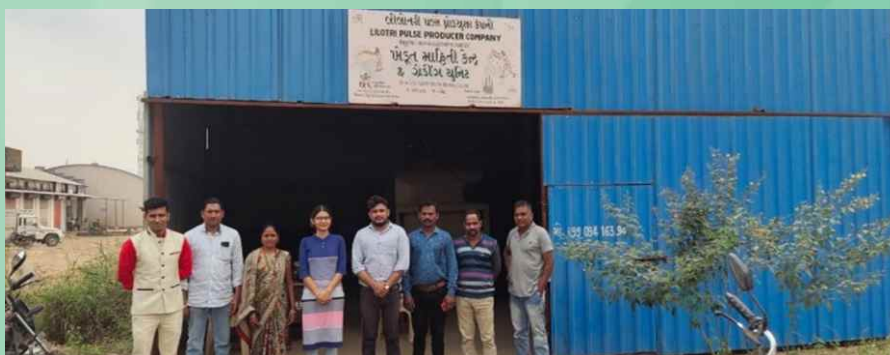
Lilotri Pulse Crop Producer Company Limited