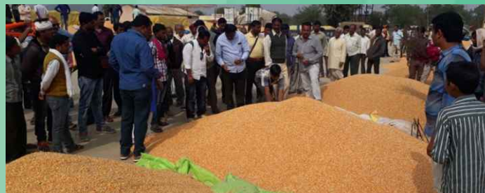
Ma Machna Crop Producer Company Ltd