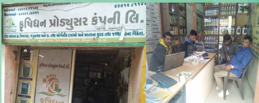
Krushidhan Producer Co. Ltd