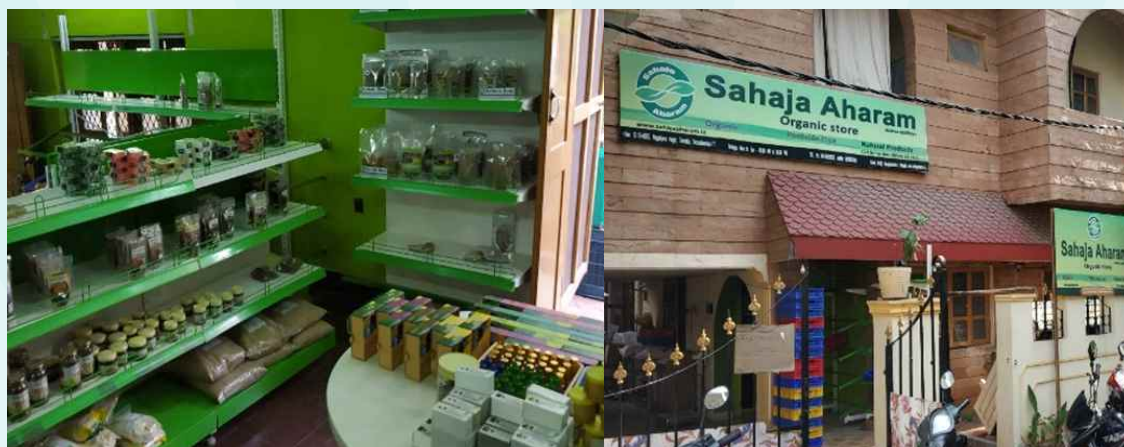
Sahaja Aharam Producer Company Limited (SAPCL)