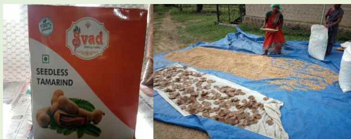
Sittilingi Valley Organic Farmers Producer Company Limited