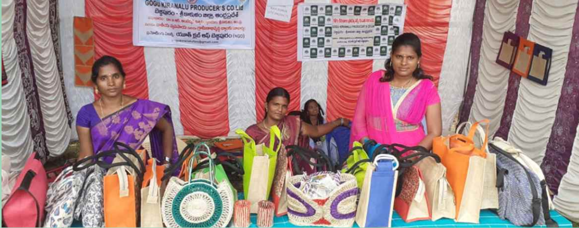
Gogukiranaluru Producer Company Limited